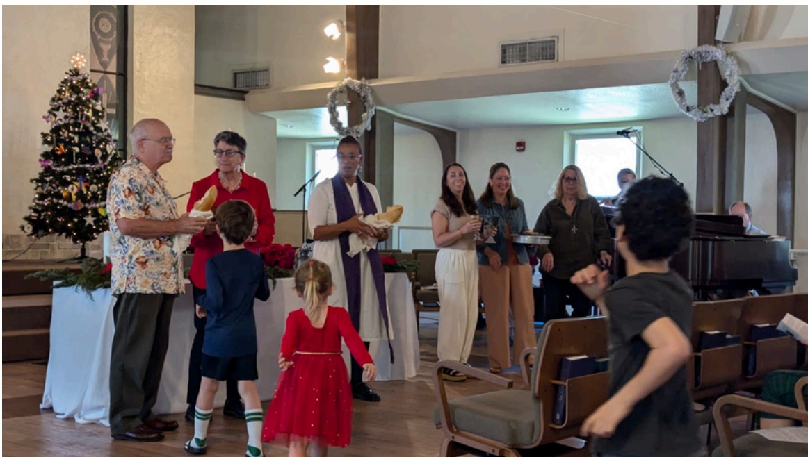
2024 December's Communion

Stay tuned for more opportunities to volunteer in our various committees.