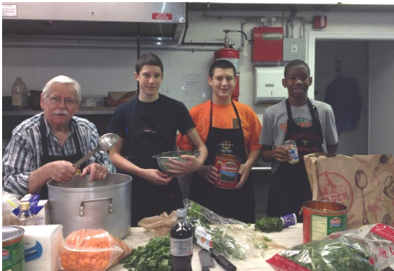
Souper Bowl 2013