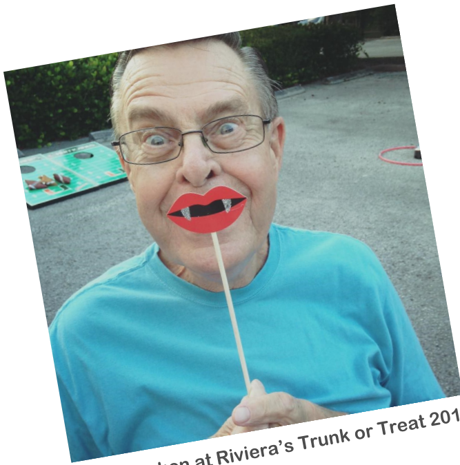
Picture taken at Riviera's Trunk or Treat 2015